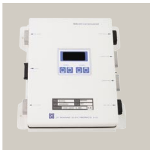
MI2002 MiniCommand Processor