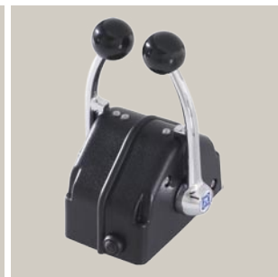
463 Control Head