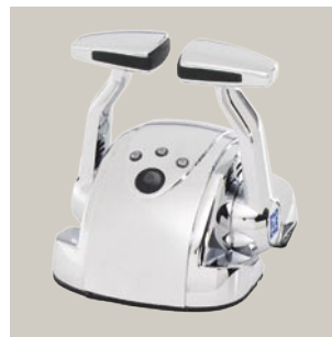
MC2000 Control Head