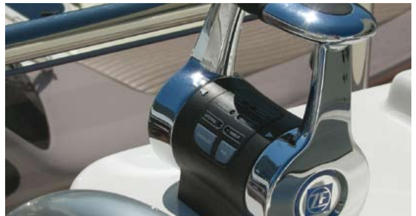
SmartCommand Control Head