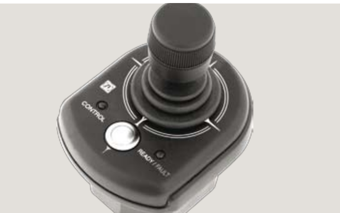
Joystick Maneuvering System

This Pod Drive System is a compact and light unit, best suited for the most popular sized pleasure crafts.